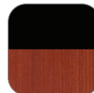
Black Base (B) Cherry Top (CH)

(Only Available on Standard 24" and 30" Configurations)