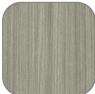
Concrete Groovz (CG)**◆