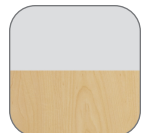
Silver Base (S) Hardrock Maple Top (HM)