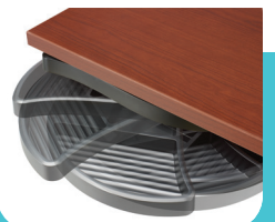
Swivel Pencil Drawer 300PTB