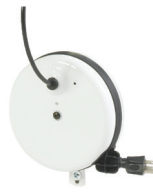
Optional 20' Retractable Power Cord 52294