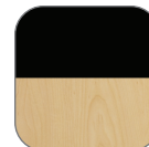
Black Base (B) Hardrock Maple Top (HM)