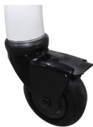
Optional Omega Casters