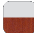
Silver Base (S) Cherry Top (CH)