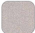
Gray Matrix (GM)◆***