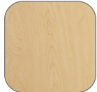
Hardrock Maple (HM)◆

Featuring eleven laminate colors with coordinating edge band options. High-pressure laminate and custom colors available.