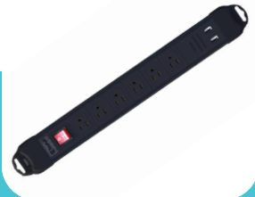
Power Receptacle PSSM-6-2