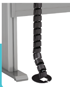
Flex Wire Management FCM490