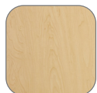
Hardrock Maple (HM) ◆

Featuring eleven laminate colors with coordinating edge band options. High-pressure laminate and custom colors available.