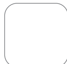
Galaxy White (GW) ◆