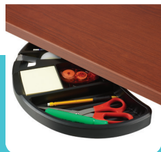
Swivel Pencil Tray 300PTB