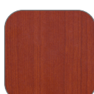
Cherry (CH) ◆