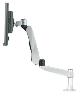
Hover Series 2 Monitor Arm HS3111