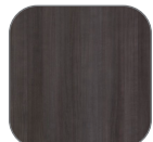
Driftwood (DW) ** ◆