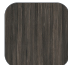
Merapi (ME) ** ◆