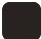
Black (BK) ◆