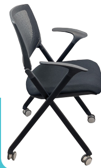
FCFTBBB Nesting Stacking Chair