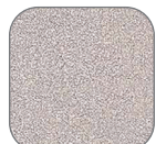
Gray Matrix (GM) ◆ ***