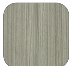
Concrete Groovz (CG) ** ◆