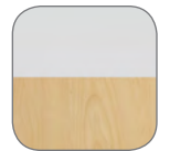
Silver Base (S) Hardrock Maple Top (HM)