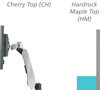
Silver Base (S) (HM)