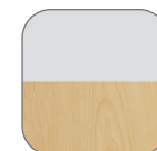
Silver Base (S) Hardrock Maple Top (HM)