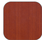
Cherry (CH) ◆