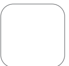
Galaxy White (GW) ◆