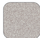
Gray Matrix (GM) ◆ ***