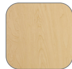
Hardrock Maple (HM) ◆

Featuring eleven laminate colors with coordinating edge band options. High-pressure laminate and custom colors available.