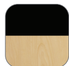
Black Base (B) Hardrock Maple Top (HM)