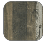
Reclamation Maple (LM) ** ◆