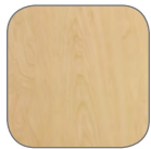
Hardrock Maple (HM)◆

Featuring eleven laminate colors with coordinating edge band options. High-pressure laminate and custom colors available.