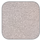
Gray Matrix (GM)◆***