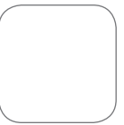
Galaxy White (GW)◆