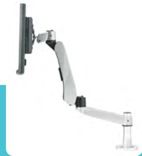
Hover Series 2 Monitor Arm HS3111