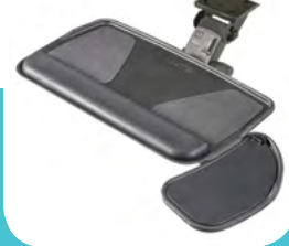
Myriad™ with FastAction Precision Arm MFP21