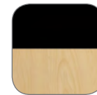
Black Base (B) Hardrock Maple Top (HM)